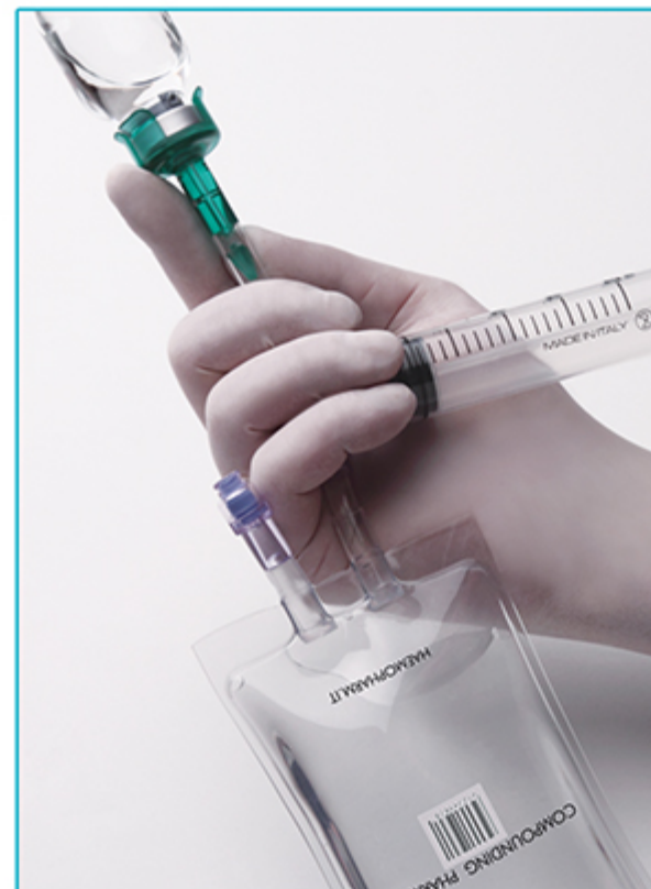
DOSED RECONSTITUTION AND DILUTION