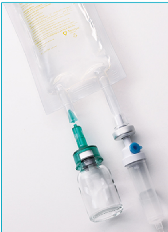
TOTAL RECONSTITUTION AND DILUTION

EXPERTISE AND SIMPLICITY IN MEDICATION DELIVERY